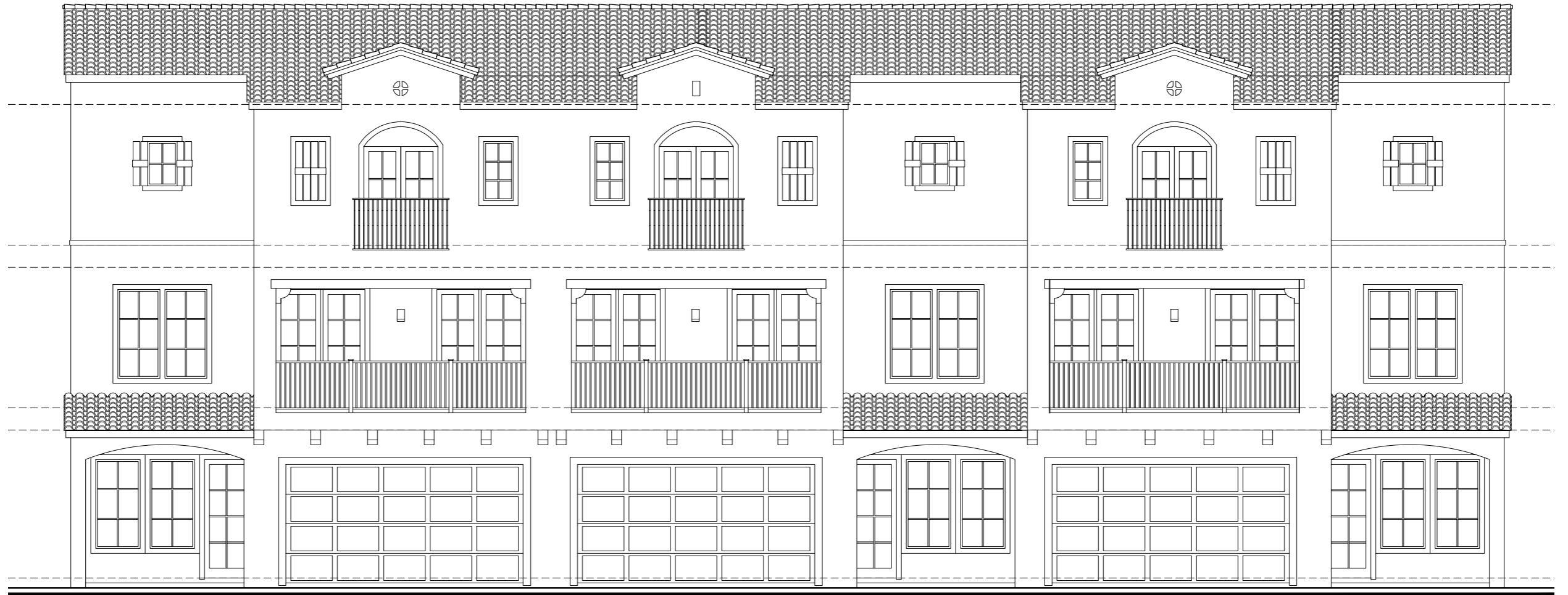
1 FRONT ELEVATION SCALE: 1/8" = 1'-0"